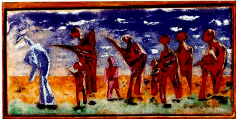
Left Fig. 5: "Foreigners Out" 2010, Enamel cloisonné on copper, matte ground, ca. 15 x 15 cm Right Fig. 6: "Asia Anno 2030, Foreigners Out" Enamel cloisonné on copper, matte ground, ca. 15 x 15 cm