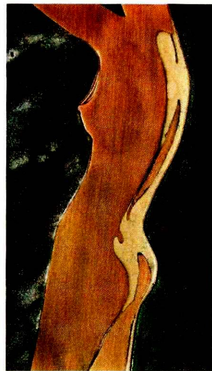
Left Fig. 2: Enamel champlevé, Ground, 10 x 15 cm Right Fig. 3: Enamel cloisonné, A combination between champlevé and cloisonné-enamel, 10 x 15 cm