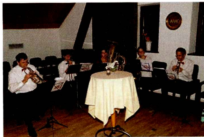
Fig. 8: The ensemble "Blechspielzeug" (Tin-Toy)

Subsequently the visitors were treated to refreshments and a beautiful buffet sponsored by the Firma Wolf, hops-machines, Geisenfeld. The artist, mayor and culture director were on hand to talk about the exceptional exhibition. gom